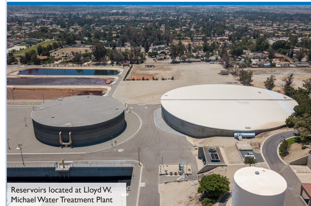
Reservoirs located at Lloyd W. Michael Water Treatment Plant

Since Cucamonga Valley Water District's establishment in 1955, our vision has been focused on people, service, and water. With a thriving service area, CVWD values the responsibility of providing nearly 200,000 people with reliable water and wastewater services, as well as Service Beyond Expectation , every day. CVWD emphasizes the importance of customer engagement and involvement and hosts multiple workshops, tours, and events throughout the year to connect with our community members.