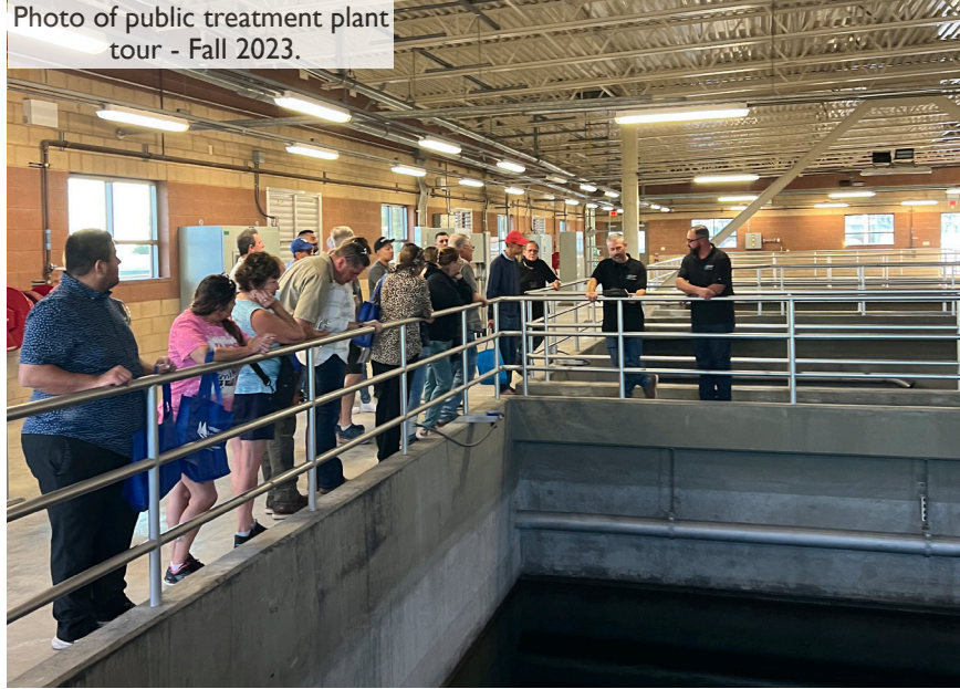
Photo of public treatment plant tour - Fall 2023.

As we head into the new year CVWD is committed to keeping our community engaged and involved. We encourage you to stay connected with us and participate in all that CVWD has to offer you in 2024. Follow us on social media @CVWDwater to stay up to date on our latest events!