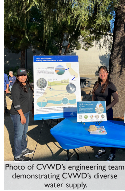
Photo of CVWD's engineering team demonstrating CVWD's diverse water supply.